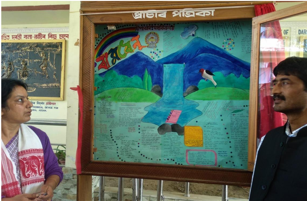
Fig: The Wall Magazine “Ramdhenu” prepared by Students’ of Sipajhar College