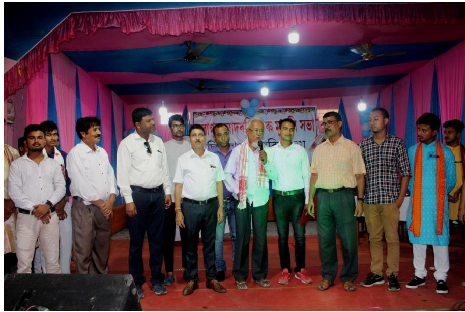
Fig: Ex- General Secretary of Sipajhar College with Principal