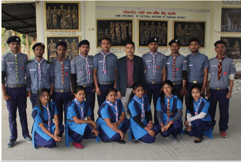
Fig: Members of Bharat Scouts and Guides with Principal