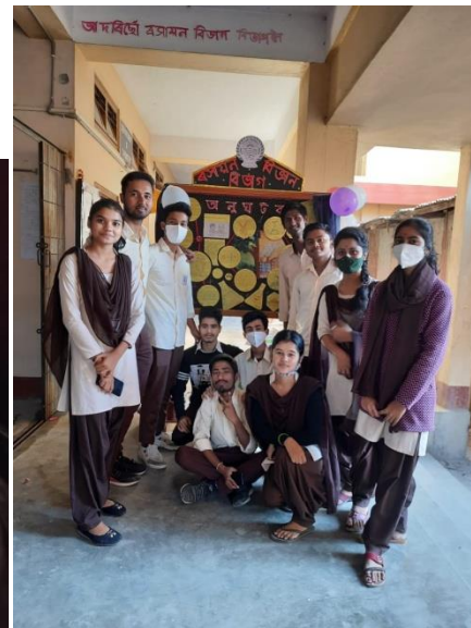
Fig: During the preparation of Wall Magazine