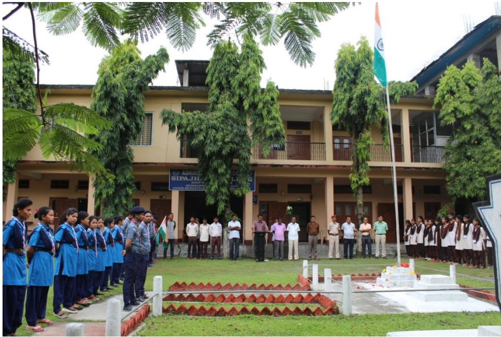
Fig: Bharat Scouts and Guides performing their roles in Independence Day Celebration