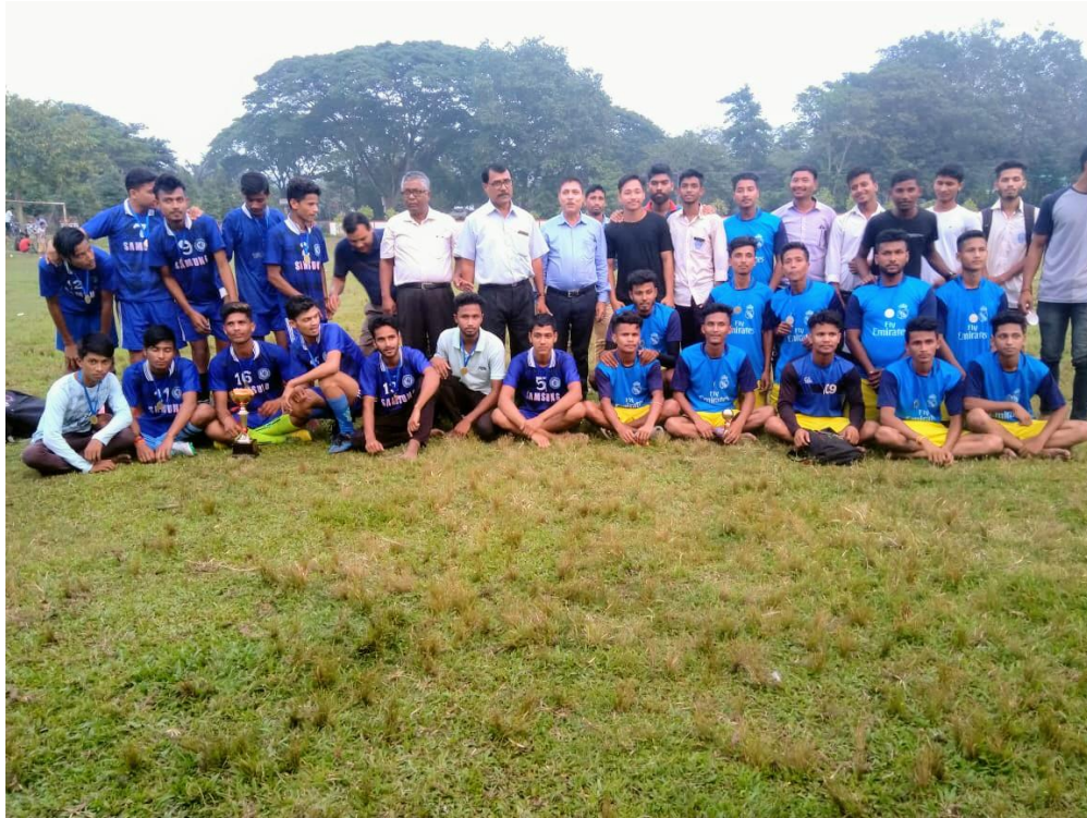
Fig: Participation of Students of Sipajhar College in Inter College Football Match